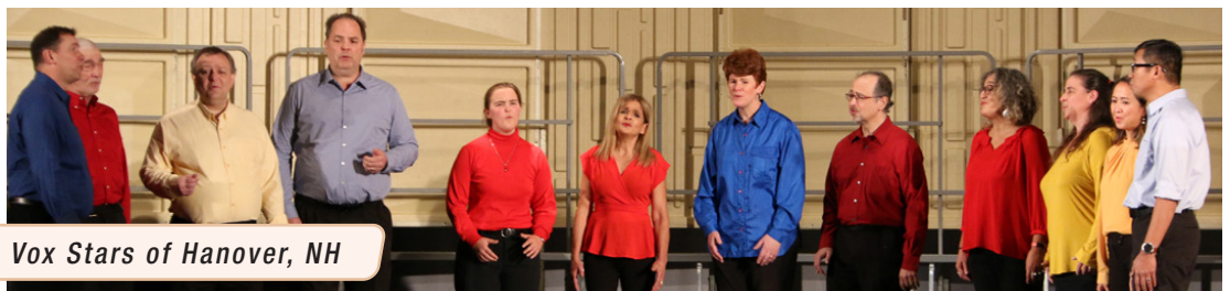
Vox Stars of Hanover, NH