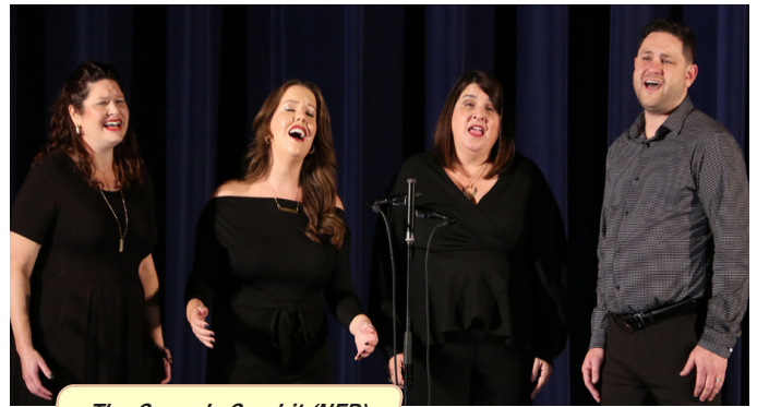
The Queen's Gambit (NED)

Please read the full text of the announcement ... here .